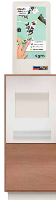
On a Cabinet