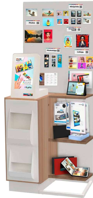
With PhotoPrintMe Wall