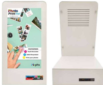
On a desktop